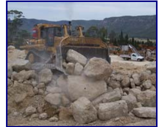
Trainees using D9 Dozer