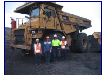
Trainees shifting a Load CAT 773

New WorkCover Tests will be in force some time in the New Year. The pass rate will now be 100%, so this will mean that some courses will need to be extended to enable trainees to meet the new WorkCover Standards. From a MTW/C&N angle, supervisors will be required to have all persons who operate high risk equipment cranes, dogging, forklifts and EWP's assessed by an RTO and issued with WorkCover tickets. There will be a 12 month compliance period to have these assessments completed.