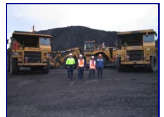
Graduates from Mining Course