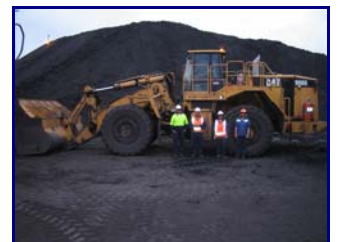
Training on CAT 988G Front-end Loader